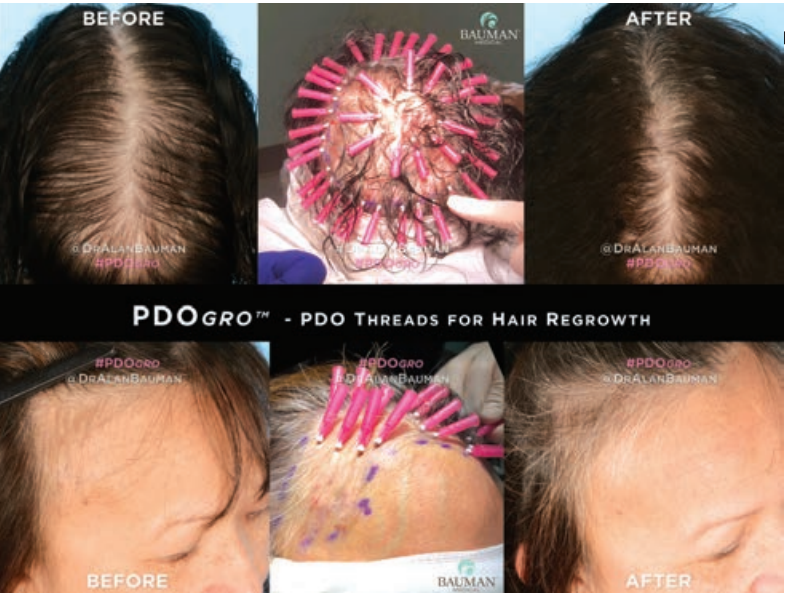
Before and after PDOgro™ by Dr. Alan Bauman

• A-List Hair Vitamin Complex™: It's called our "strategic supplement" because it's compounded with top-tier ingredients shown to strengthen hair and support skin elasticity. It contains antioxidants and trace minerals that protect hair and skin, promote collagen renewal for hair, skin hydration and wound healing.