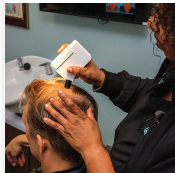
During a Trichological (Scalp) Evaluation, state-of-the-art technology is used to measure pH balance, sebum levels, and scalp elasticity, and microscopic photos to look for any scalp abnormalities.