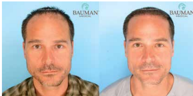
Before and 12 months after FUE Hair Transplant by Dr. Alan Bauman

technology that uses ultrasonic sound waves and air pressure to enhance the penetration of a specialized topical hair growth serum into the scalp.