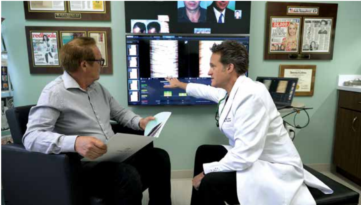
Bauman Medical has the latest diagnostic tools to measure hair loss and your progress from treatment, including HairMetrix®, which uses A.I. to provide digital readouts with the exact number of hairs and the caliber of those hairs, comparing them in different zones.

characteristics of your metabolism contributing to your particular hair loss situation. An algorithm identifies the treatment options likely to be most beneficial to you, saving time and improving results.